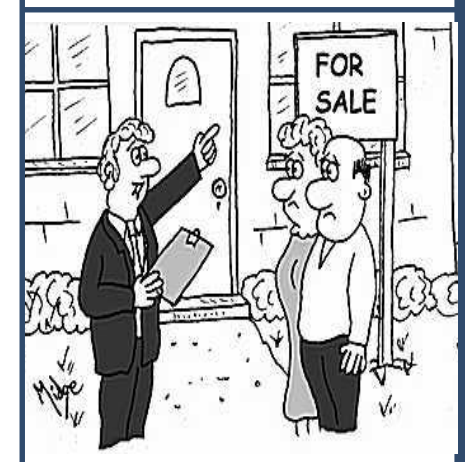
"I know this one is a bit pricy, but just think about how much negative equity you will have to brag about when the market finally crashes!